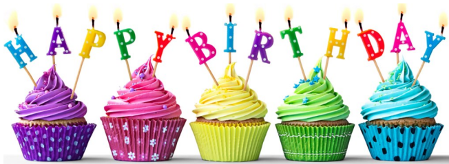
Birthdays for the month of February: